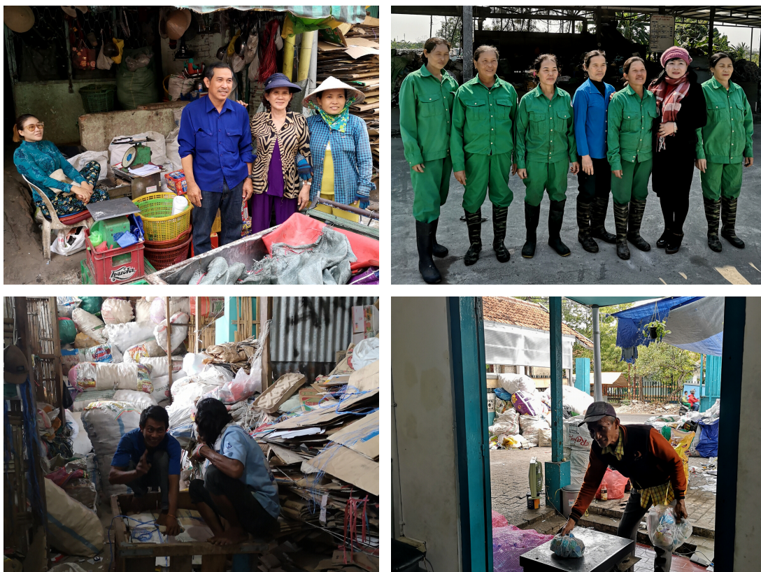
Figure 1: The Informal Sector Can be Hard to Identify

They are often vulnerable people who occupy the lowest rungs of the socioeconomic ladder, with limited education and sometimes precarious access (and rights) to life’s basic necessities: work, healthcare, housing,